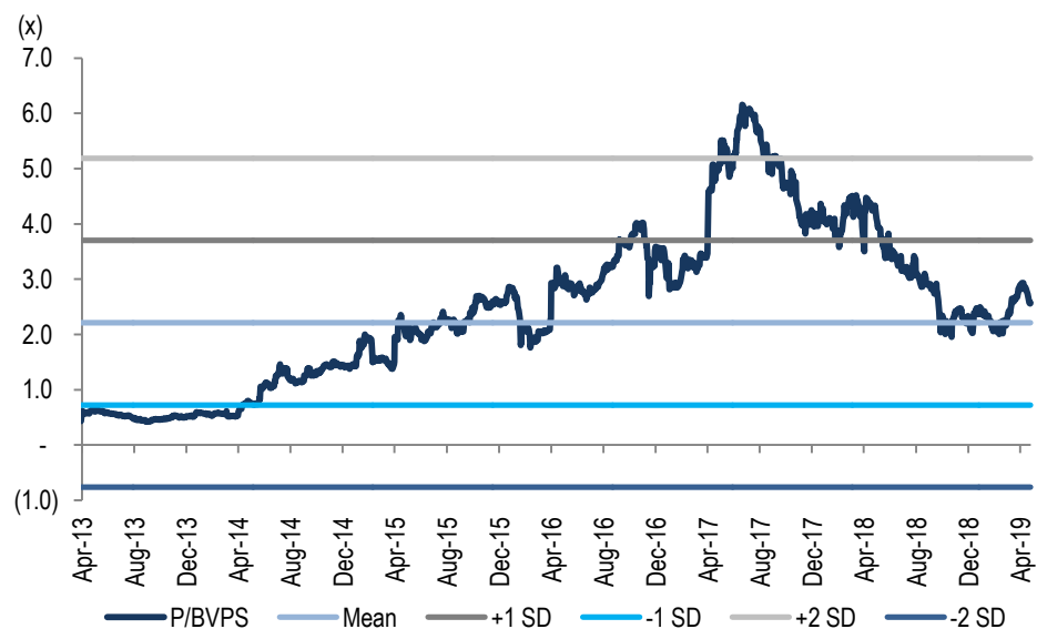
Exhibit 4: One-year forward P/BV

Source: Company, Nirmal Bang Institutional Equities Research